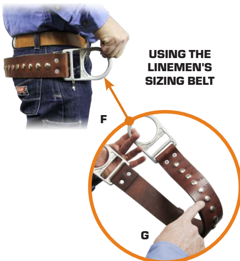
USING THE LINEMEN'S SIZING BELT

By trial and error, change the length of the LSB until the belt is the correct length, and note the adjusted size of the belt (G).