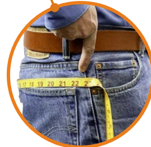
USING A TAPE MEASURE