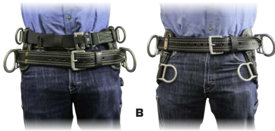
CORRECTLY SIZED TOOL BELT

If a belt is sized correctly, the hip D-Rings will point straight ahead, and the tongue adjustment will be in the center hole (B).